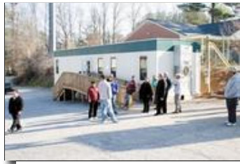
Day laborers gather for work at the Holy Spirit Catholic Church's Solidarity Mission on Northwood Drive. (click for larger version)

"It's a safer, more dignified alternative to looking for a job on the